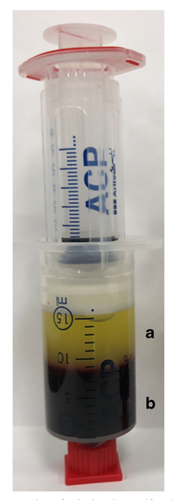
Fig. 1 The resultant product of a single spin centrifugation, with an upper plasma layer (a) and a lower layer (b) containing both leukocytes and erythrocytes

Not all PRP is the same, and preparation methods lack a standardized protocol [28]. After a blood sample is collected from the patient, that sample is run through a centrifuge, which separates the samples cellular products based on different specific gravity [29]. One primary difference in PRP systems involves this centrifugation, which can involve either one or two spins through the system. Systems utilizing one spin, such as autologous conditioned plasma (ACP) (Arthrex, Naples, Florida) and Cascade PRP (MTF Biologics, Edison, New Jersey), separate the sample into a plasma layer containing platelets and a separate layer containing red and white blood cells (Fig. 1). These one-spin systems typically result in platelet concentrations that are 1 to 3 times greater than whole blood; furthermore, the one-spin systems are efficient because they typically have short preparation times (under 10 min), which can remove the need for an anti-coagulant to be added to the preparation to prevent clotting. PRP systems that utilize two spins, like the Biomet GPS (Zimmer Biomet, Warsaw,