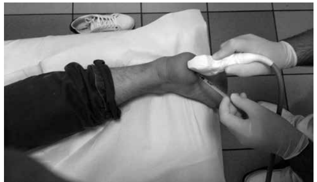
Figure 1. Ultrasound guided injection.

A total of 60 patients diagnosed with plantar fasciitis were included in the study between October 2014 and October 2015. All patients were randomly divided into two groups by computer (prolotherapy [n=29] and control [n=31] groups). Diagnosis was based on the identification of symptoms and physical examination findings. A lateral radiograph of the ankle was taken to exclude epin calcanei. Patients with tarsal tunnel syndrome and epin calcanei were excluded from the study.